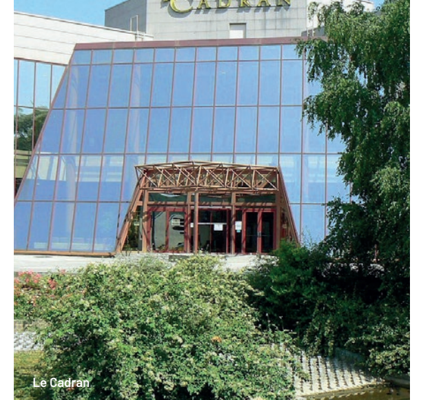
All facilities are located in the city centre and are easily accessible with free parking nearby.